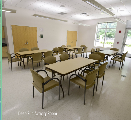
Deep Run Activity Room