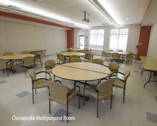
Chesapeake Multipurpose Room